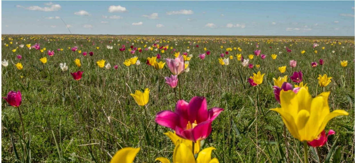
In some years we are lucky to come across steppes full of Schrenk's Tulips. Did you know tulips are originally from Kazakhstan?

and lakes, is home to wolves, marmots and saiga antelope. However, it is the birds that are the real attraction. Located at the crossroads of two migration routes, the wetlands act as a giant motorway junction service station for birds (Lake Tengiz alone has the capacity to feed 15 million birds).