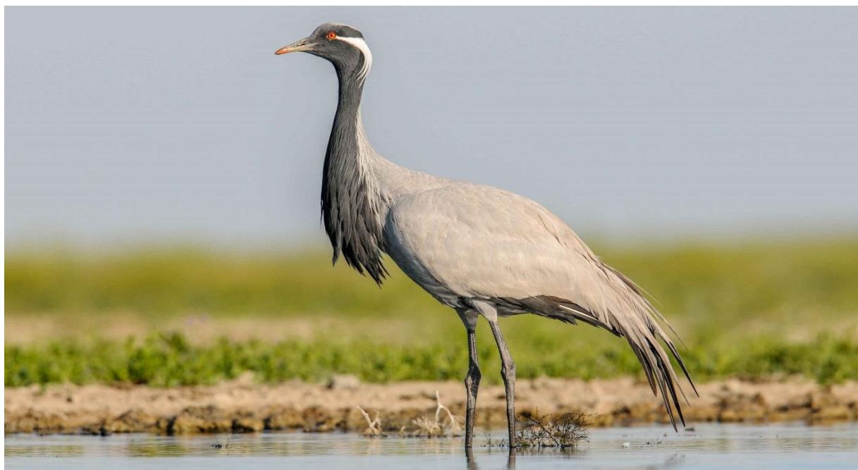
Close views of gorgeous Demoiselle Cranes are almost guaranteed

May 14, Day 13: Drive to Karakol, Kyrgyzstan. The day starts with a walk on the Sogety plains to secure that everybody has seen the Pallas's Sandgrouse. This elegant bird is unfortunately always difficult to see because of its skulky behaviour and rare existence in this part of Central Asia. In the Kokpek Pass we might come across ten-thousands of Black-veined Whites. These gorgeous butterflies fly in large numbers during the month of May. Our