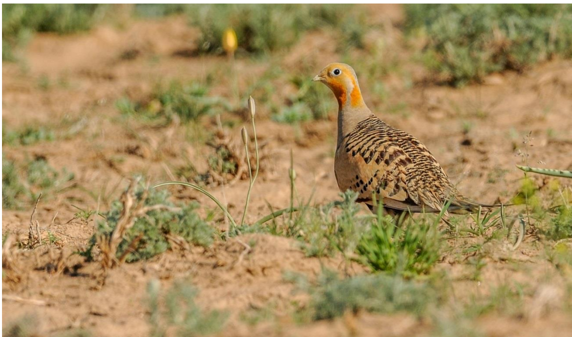
During our excursions in the Sogety Plains, we focus on finding the rare Pallas's Sandgrouse.