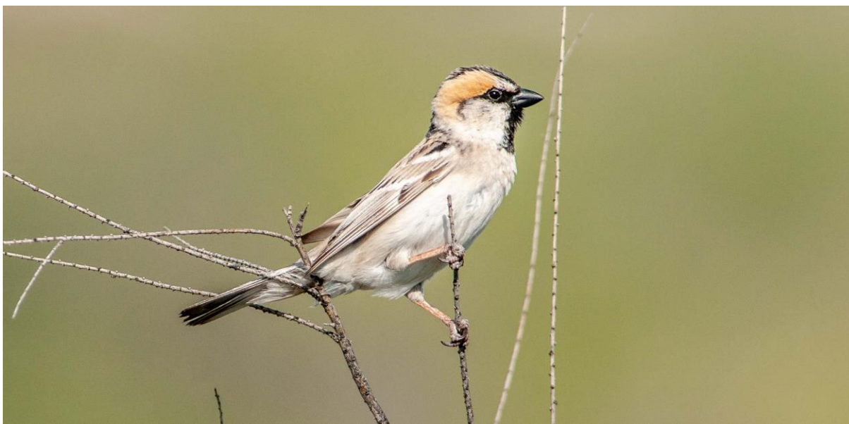
Range-restricted Saxaul Sparrows are found in the rare Populus diversifolia forests near Lake Balkhash.

May 19, Day 18: Taukum Desert & Turanga Woodland. Today is a wonderful day in which we will encounter a wide variety of habitats and some fine birds and other wildlife. Awakening in the midst of this remote desert, we will likely be watching the amazing display of McQueen's Bustards close to our camp; Caspian Plovers are breeding nearby; and wolves are spotted together with Persian Gazelles—all before breakfast! Then we will set forth along narrow back-roads through a variety of steppe/desert habitats to an area of unique Turanga woodland. Here, with a bit of luck, we should encounter such specialties as Turkestan Tit, Saxaul Sparrow, White-winged Woodpecker, Pale-backed Pigeon (Eversmann's or Yellow-eyed Dove) and if we are especially lucky, Pallid Scops-Owl. Along the way we will undoubtedly encounter a myriad of Greater Short-toed, Lesser Short-toed and