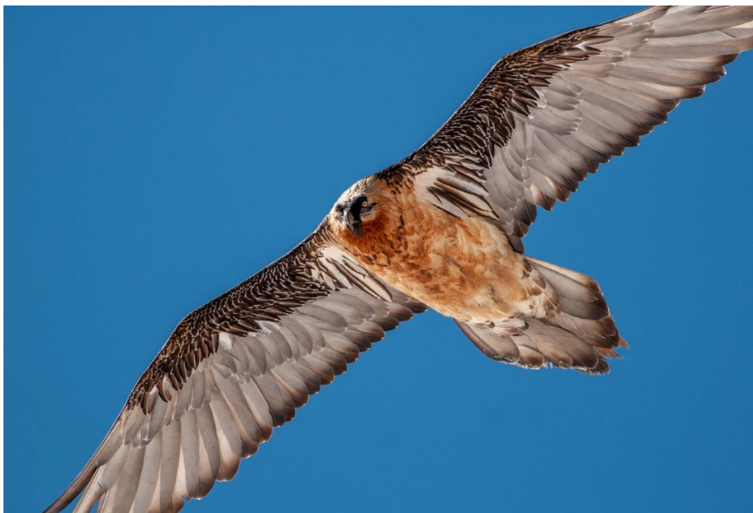
Impressive Lammergeiers soar overhead in the Tien-Shan.

May 15, Day 14: Chon-Ashuu (May Saz). Today we drive up to great heights with an excursion to Chon Ashuu Pass, the highest pass on the tour at a dazzling 3,822 meters (12,539 feet). We will venture way past the tree line and look for a rather special set of avifauna. The nearby wild streaming river holds both White-bellied and Brown dipper. Lammergeyers patrol the sky. The lush meadows are home to one of the strangest waders of the world—the elusive Ibisbill. Eversmann's Redstart together with Himalayan and Brown accentors are quite common up here. The gorgeous White-browed Tit-Warbler needs some more time to be found as well as his colorful friend, the Güldenstädt's Redstart. In the open patches of mature, mixed deciduous/coniferous forest, Greenish and Hume's warblers are quite common. In the evening we return to our lovely guesthouse in Karakol to enjoy another flavorful dinner.