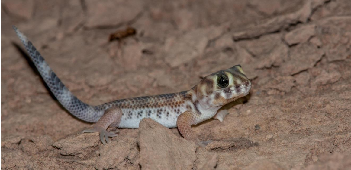
We will explore the area around our private yurt camp in hopes of finding the cute Common Wonder Gecko.

NIGHT: Comfortable yurt camp, Taukum Desert