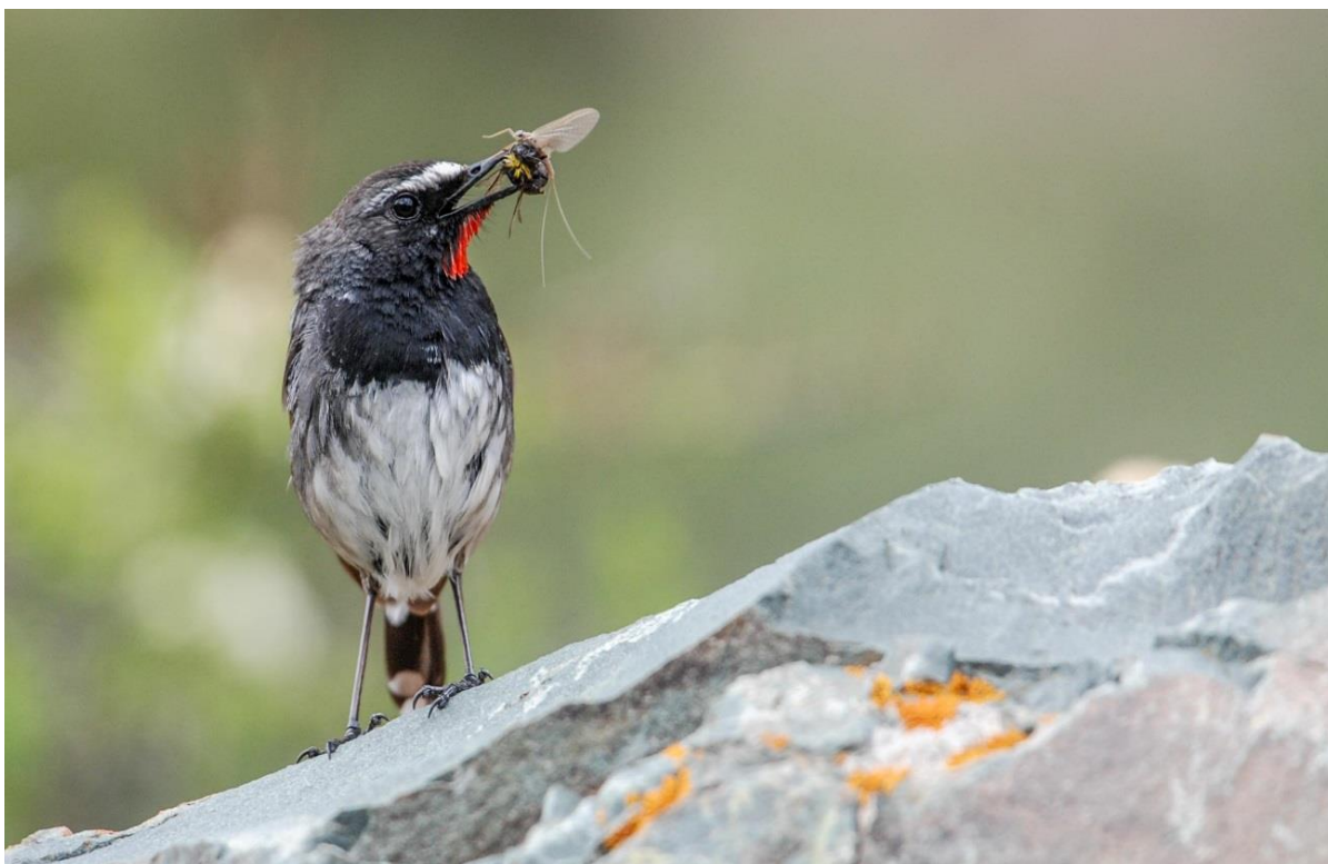
Captivating White-tailed Rubythroats await in the high mountains of the Tien Shan.