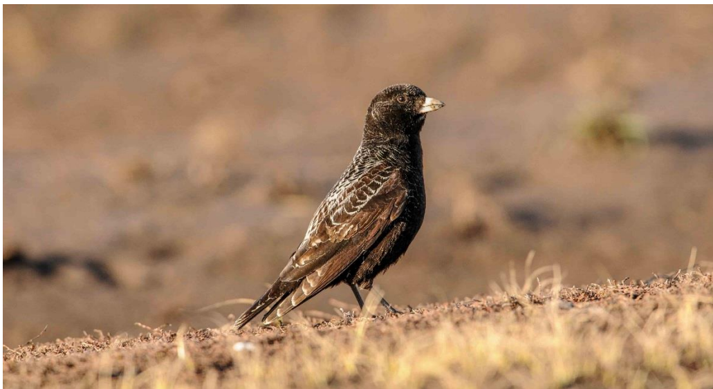
THE major highlight of a visit to the northern steppes is the near-endemic Black Lark. © Machiel Valkenburg

The area, most of which is protected as a 'Zapovednik' (national nature reserve), is home to the world's northernmost population of Greater Flamingo—one of over 300 species of birds, which includes one of the largest wildfowl populations in Asia. Other notable residents include pelicans, cranes and a variety of birds of prey.