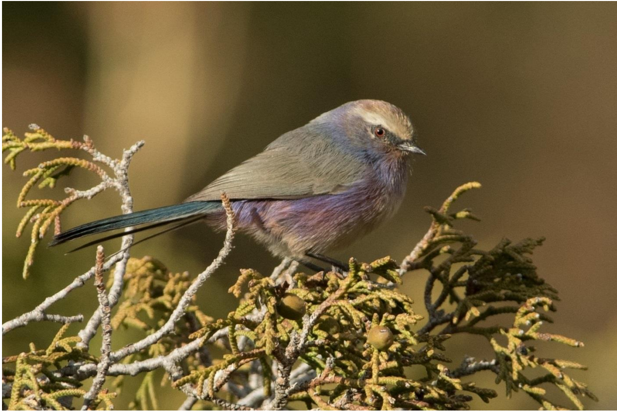
Stunning White-browed Tit-Warblers inhabit junipers in the Tien Shan Mountains

unforgettable experience, and we feel sure that participants will be delighted with extraordinary Central Asia.