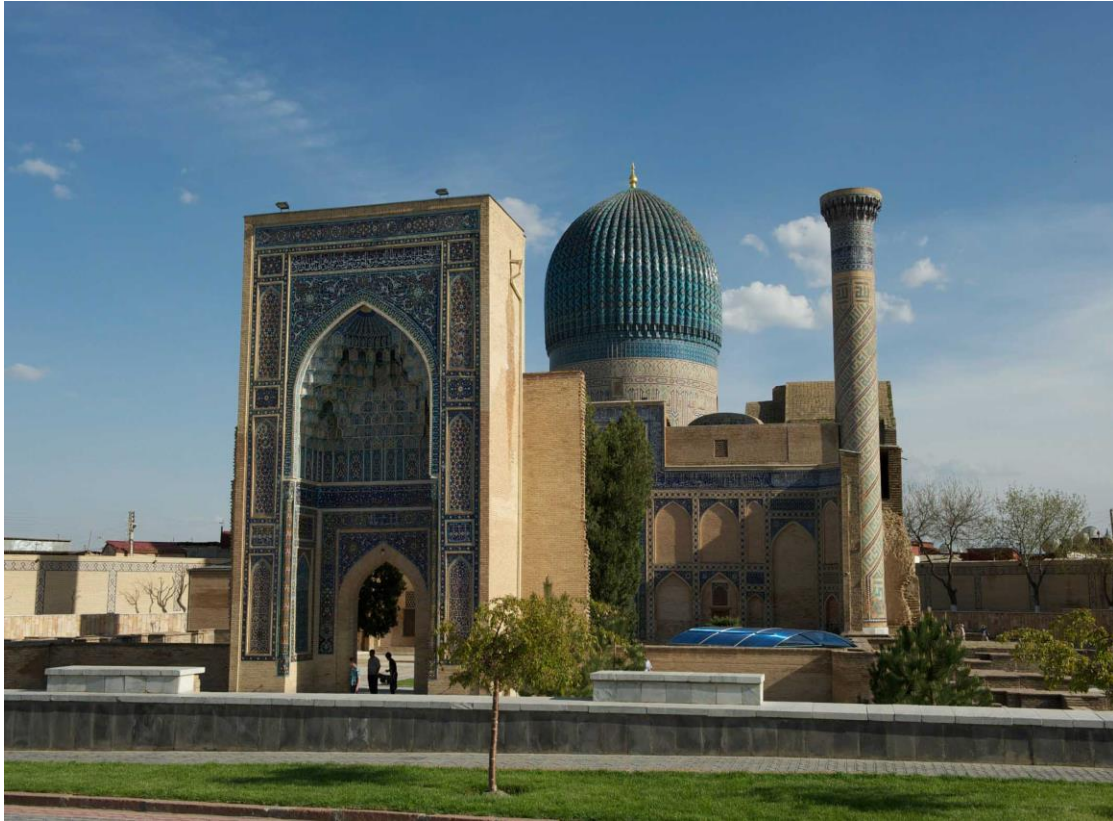
Gur-Emir Mausoleum, Tombs of the Temurids, Uzbekistan

in centuries past. (Tamerlane was a Turco-Mongol conqueror who founded the Timurid Empire in and around modern-day Afghanistan, Iran and Central Asia, becoming the first ruler of the Timurid dynasty.) High on the wanted list will be White-throated Robin along with Eastern Orphean Warbler and the obscure Hume's Lark. Also here are Eastern Rock Nuthatch, Turkestan and Yellow-breasted tits, Amur Paradise-Flycatcher and White-capped Bunting. Back in time for lunch, we will wander from our hotel into the quiet, small ancient city area to explore its historical treasures. The massive Bibi Khanum mosque (once the largest in Central Asia), The Registan, Timur's Mausoleum, the Street of Tombs and the local bazaar present a stunning and memorable "visual overload" of exquisitely elaborate tiled, painted and carved buildings.