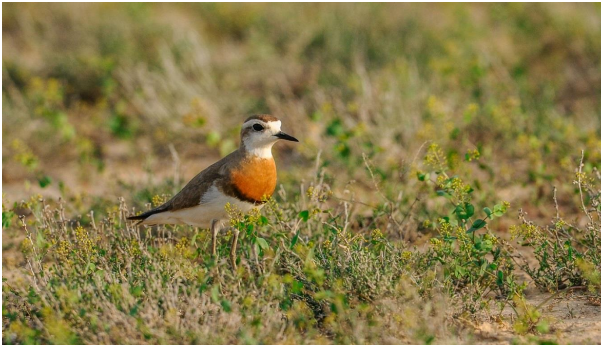
Exquisite Caspian Plovers are found in the Tau-Kum Desert

For a long time, Kazakhstan has been known for its large variety of rare Western Palearctic species and alluring steppe species like Black Lark and White-winged Lark. In Kazakhstan everything is on a vast scale, which is not surprising as it's the ninth largest country in the world! Great expanses of flat steppe grasslands merge into sandy and stony deserts. Dotted here and there are saline and freshwater lakes which act like magnets to nesting and migrant birds. The bird-life is stunning! Apart from a large list of more typically European species, there is a stunning list of very special breeding birds largely confined to Central Asia. The most attractive to us Western birders are near-mythical species such as the previously mentioned Black and White-winged lark; the endangered Sociable Plover; sensational displaying Macqueen's Bustard; flocks of the secretive and rare Pallas's Sandgrouse; colorful Caspian Plover which are only hundreds of yards away from our sleeping quarters; and tiny Asian Desert Warblers singing loudly in the vast plains of Sogety. Visits to the declining Turanga Forest near Balkhash Lake is a certainty for White-winged Woodpeckers, Saxaul Sparrow, Shikra and the very rare Yellow-eyed Pigeon.