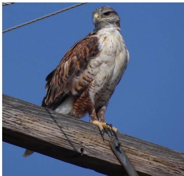
A Ferruginous Hawk takes advantage of a rare elevated perch on the Nebraska prairies.

After witnessing this moving sight, we'll leave the Platte and its many thousands of cranes behind. As we move west and north toward the city of North Platte, we should run across more waterfowl and a good selection of raptors, sometimes including Ferruginous Hawk or Prairie Falcon among the common Red-tailed Hawks, Northern Harriers, and American Kestrels. Greater Prairie-Chickens are occasionally seen flying across the road, but we can hope for far better views of that species to come.