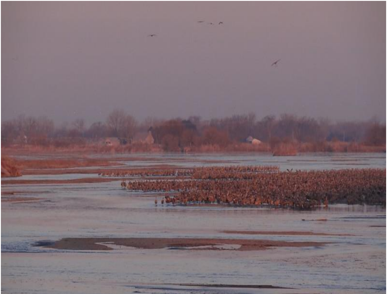
A small roost of Sandhill Cranes awaits sunrise on Nebraska's Platte River