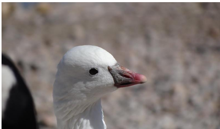
A quizzical Ross's Goose watches its watchers

NIGHT: Fairfield Inn and Suites, Kearney, Nebraska