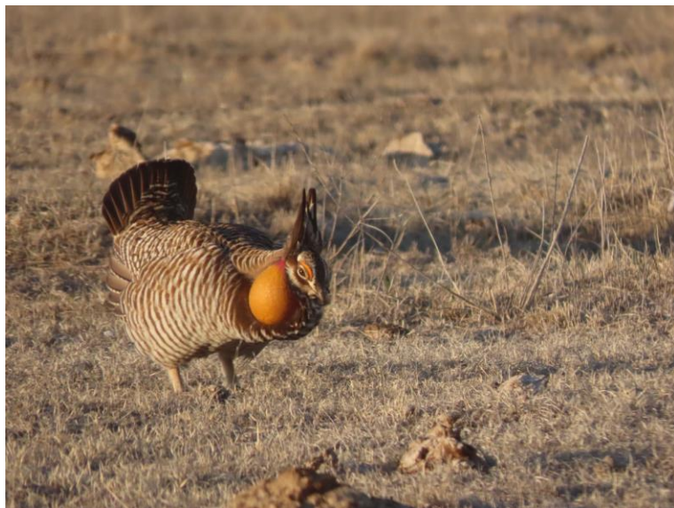
This fine Greater Prairie-Chicken must be irresistible to the females—and he seems to know it.

NIGHT: Holiday Inn Express, McCook, Nebraska