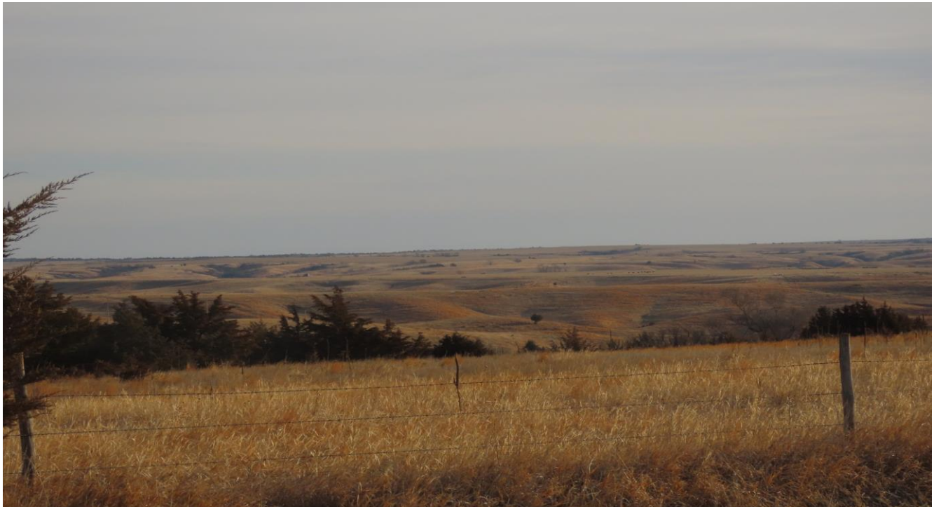
Approaching the Loess Canyons

March 21, Day 7: The Lower Platte and Return to the East. The migration of the Whooping Crane through central Nebraska typically begins in early April, but recent years have seen one or two birds appearing in the Grand Island area as early as mid-March. The return of the Whooping Crane is one of the great conservation stories of the past 100 years, the result of the unflagging efforts of talented scientists and responsible landowners. If one of these birds—or an even rarer Common Crane, an annually occurring needle in the big gray feathered haystack—has been reported, we will spend the morning in search of the rarity; otherwise, after breakfast, we will make the two-hour drive back to the Omaha area, with a stop, time permitting, at one of the most productive birding sites on the lower Platte River, Schramm Park.