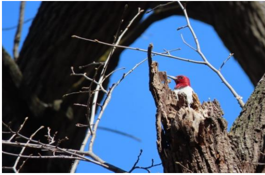
Red-headed Woodpecker

March 16, Day 2: Missouri River Valley and West to Kearney. After breakfast in our hotel, we will spend the morning exploring the wooded bluffs and floodplain of the Missouri River, an important corridor for a wide range of migrants and home to several resident species near the northwestern edge of their range. We should find a few Harris's Sparrows among the juncos and American Tree Sparrows, and we will check blackbird flocks for wintering or migrant Rusty Blackbirds. Wild Turkeys occur in good numbers, and we might turn up Barred Owl, Pileated Woodpecker, Tufted Titmouse, Carolina Wren, or other woodland birds more typical of areas farther south and east in the U.S.