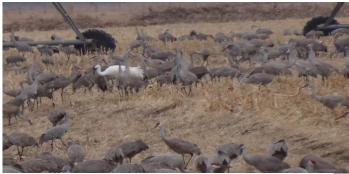
Whooping Crane

March 20, Day 6: Return to the Platte. We'll check out of our hotel this morning, then start our drive east to Grand Island, two and a half hours away. Weather permitting, our route this time will take us north and east into the Loess Canyons region, where hundreds of American Robins are often joined by smaller numbers of Townsend's and Eastern and Mountain Bluebirds feeding on the abundant eastern red cedar cones.