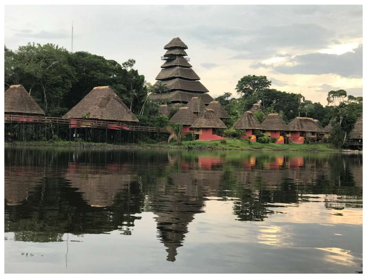
Napo Wildlife Center lodge on Añangucocha Lagoon

vision is one of a healthy environment, one that will support their traditional way of life, while at the same time keeping them connected to a constantly more globalized world through sustainable management. Every member of the village has been involved in the planning and construction of the lodges. Hunting was discontinued years ago by unanimous decision, and the local school has been preparing its students with comprehensive courses in conservation, ecology and ecotourism. Our first two nights here will be spent at the Napo Cultural Center, located right in the Añangu Community. This offers us the chance to meet some of the local people and learn about their lifestyle, plus it is convenient for visiting the parrot licks and islands on the Napo River. After two nights here we will bird our way upstream by canoe to the actual Napo Wildlife Center facility.