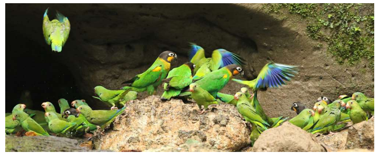
Orange-cheeked Parrots and Cobalt-winged Parakeets at clay lick (saladero)

<u>January 17, Day 3: Napo Cultural Center & Napo River</u>. Today we will explore various areas along the Río Napo, including: two saladeros (clay licks) that attract hundreds of parrots, parakeets, parrotlets and even some macaws; a river island to seek out the specialized species inhabiting that unique habitat; and an incredible canopy tower from a vantage-point overlooking the jungle canopy.