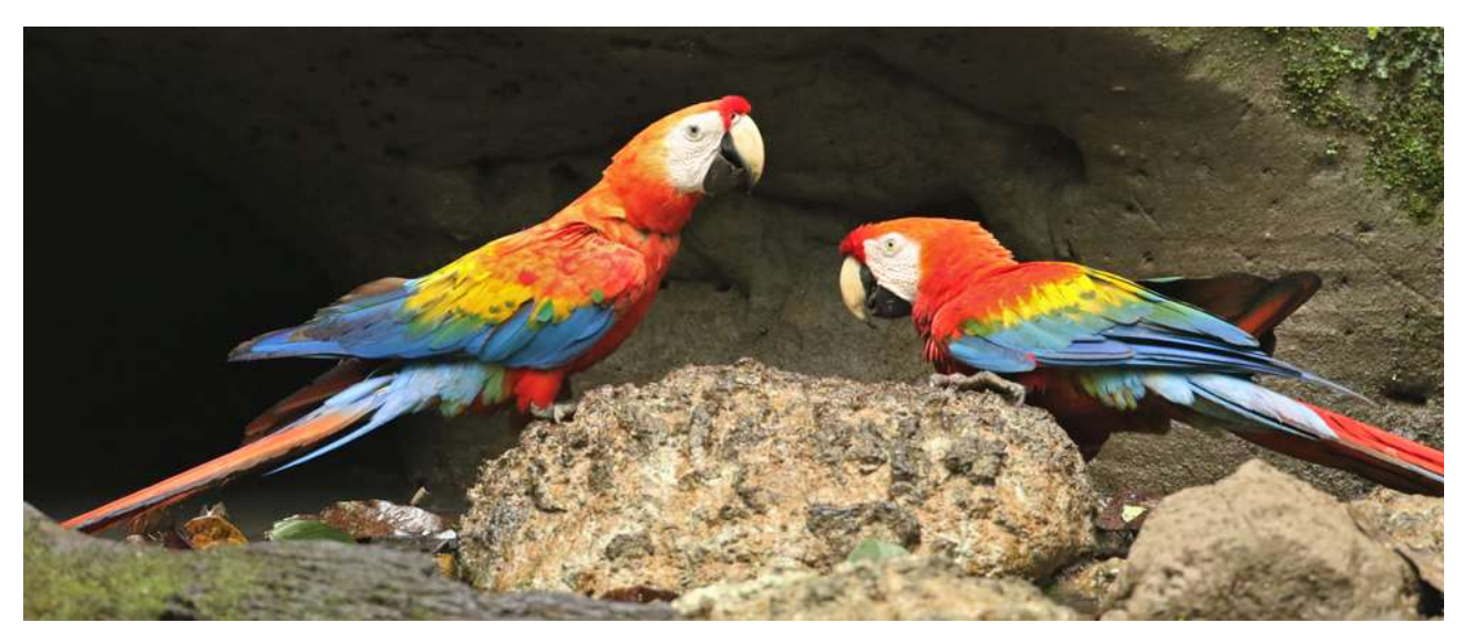
Scarlet Macaws at forest clay lick, Yasuní National Park © Brian Gibbons

Please note this tour may be taken in combination with Ecuador: Eastern Slope of the Andes, January 22-February 1, 2024.