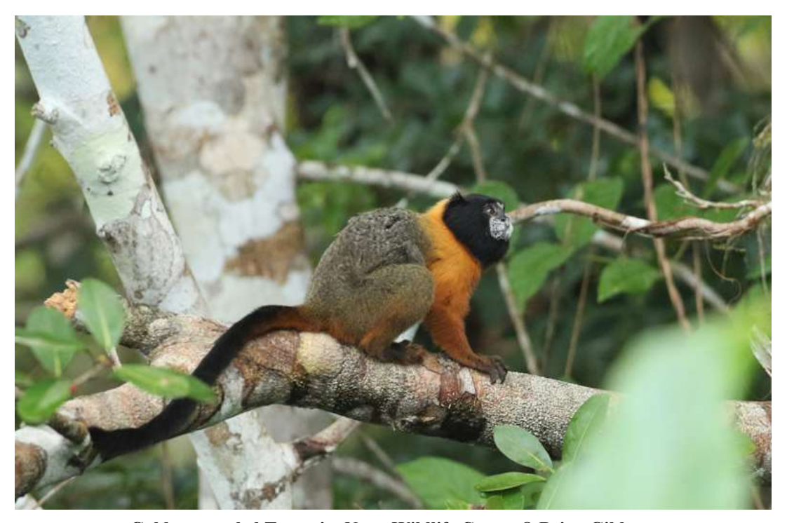
Golden-mantled Tamarin, Napo Wildlife Center

<u>January 18–22, Days 4–8: Napo Wildlife Center.</u> This morning we will depart the Cultural Center and spend part of the morning birding along the Napo River. After a scrumptious buffet lunch at the Napo landing area, we will board hand-paddled canoes to undertake a most unforgettable afternoon wildlife experience as we float and paddle along the mystical blackwater Añanguyacu stream, and its densely vegetated banks, to the Napo Wildlife Center. Getting our initial view of this impressive jungle lodge as we exit onto Añangucocha Lagoon is a remarkable experience. The sights and sounds of this varzea rainforest domain, teeming with birdlife, primates, caiman, the possibility of an (up-close-and-personal) encounter with a family of Giant River Otters, and who knows what else, guarantees a memorable adventure.