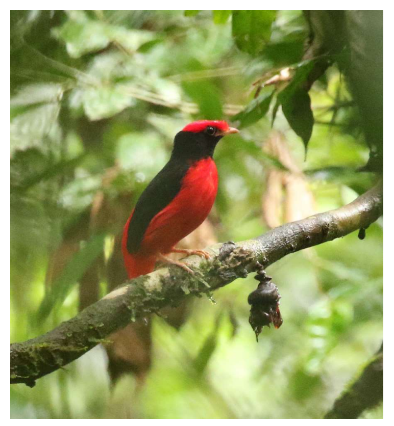
Black-necked Red Cotinga

and other cotingas; and a great variety of antbirds, manakins, flycatchers, tanagers and more—the list just goes on and on! Almost 600 species of birds have been recorded in this region and we will certainly find a lot of them.