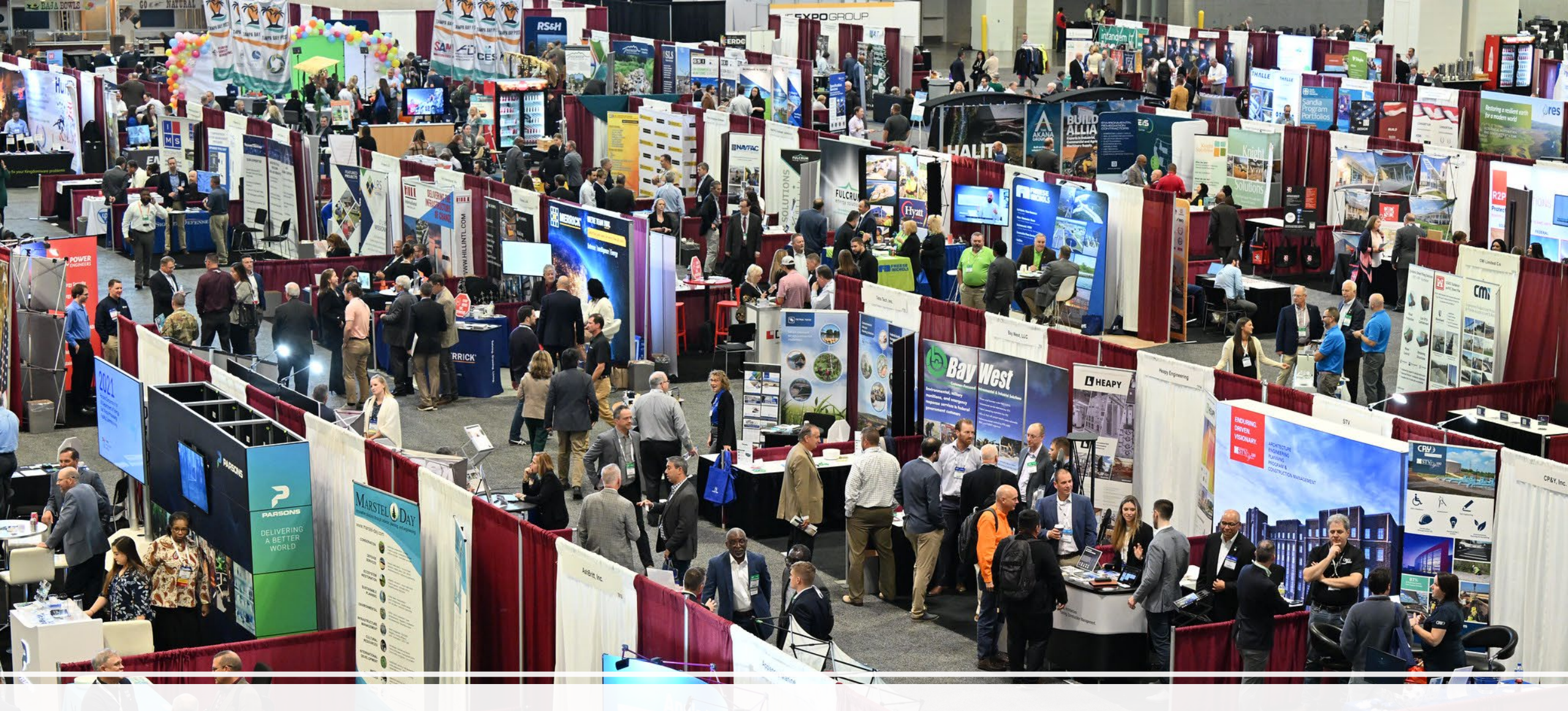
Exhibit Hall – Hundreds of Potential Partners + Solutions Providers